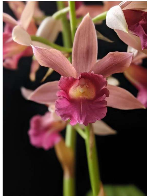
Phaius Lady Ramona Harris 'Looking At You' AM/AOS