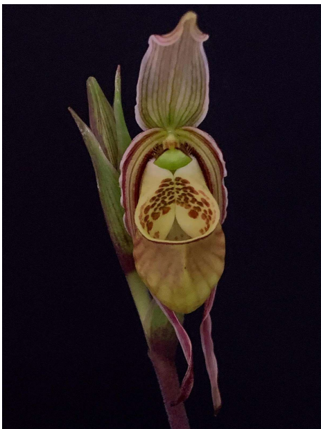
Phragmipedium caricinum